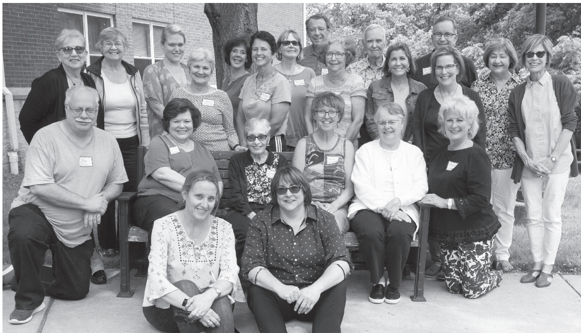
“A Day Away” Spiritual Retreat, June 2019, sponsored by Adult Spiritual Development