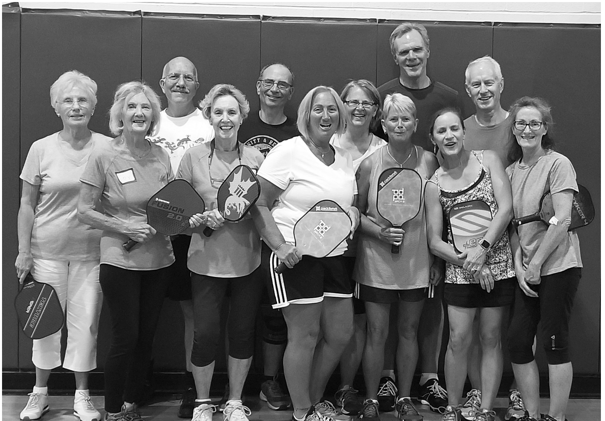
Pickleball at Westminster Recreation & Outreach Center, July 2019.