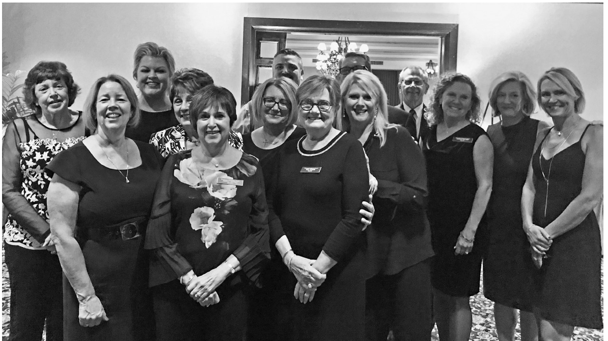
Deacons at the Giving Gala fundraiser event, November 2019.