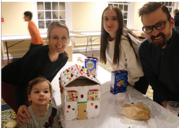
Family Gingerbread Night

before journeying upstairs to the Ash Wednesday worship service together. This evening was so special, and we look forward to continuing the tradition next year.