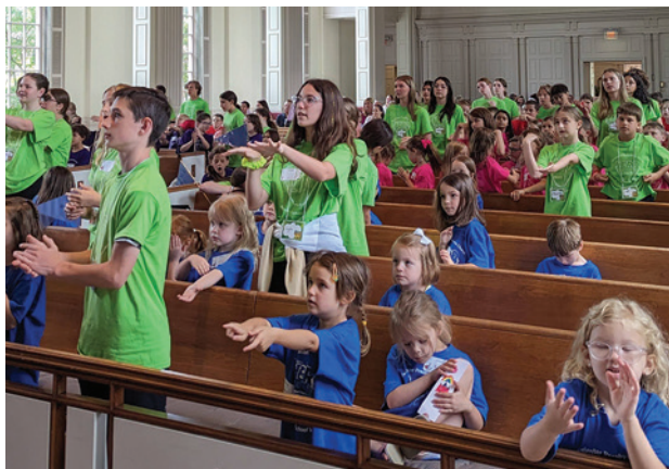
Barefoot Vacation Bible School

summer with a family bonfire night at Gilfillan Farm. In August, we enjoyed a pool party with plenty of swimming, pizza, conversation, and play. The Fall Festival returned in October where families from Westminster, WECEP, and the community came to enjoy crafts, games, and pumpkin picking. Of course the holiday season included two beloved Westminster events: Breakfast at the Manger and Family Gingerbread Night. Breakfast at the Manger was a lovely way to celebrate the Advent season and saw a huge jump in registrations compared to previous years. After a delicious pancake breakfast, JAM students acted out the Christmas story for those in attendance. Children then made crafts to celebrate the season as parents enjoyed fellowship together. Family Gingerbread Night hosted 30 families who expressed their creativity with icing, graham