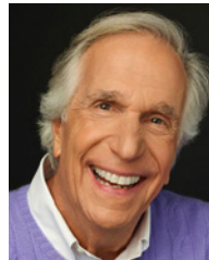
Henry Winkler March 19, 2024