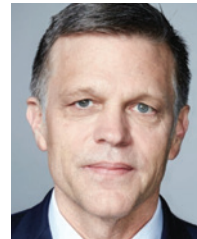
Douglas Brinkley April 9, 2024