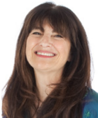
Ruth Reichl December 5, 2023