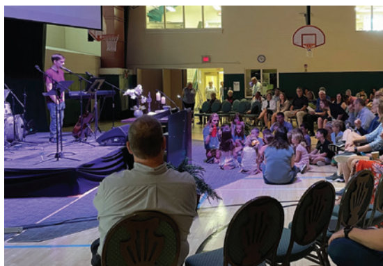
The contemporary Bridge Worship service.