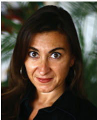
Lynsey Addario November 7, 2023